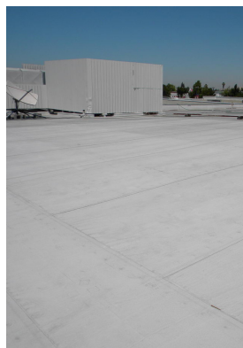
Coating for a low-sloped roof