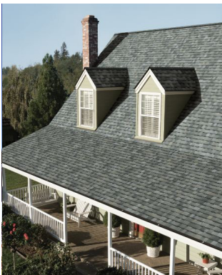
A residential cool roof

The Cool Roof Rating Council (CRRC), at www.coolroofs.org , is the sole entity the California Energy Commission recognizes for certifying the solar reflectance and thermal emittance values of roofing products. Only reflectance and emittance values listed within the CRRC's Rated Products Directory may be used to meet cool roof requirements. Products that meet CRRC certification requirements will feature the CRRC label.