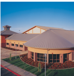
A non-residential cool roof