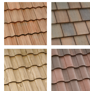
Cool Roof tile samples