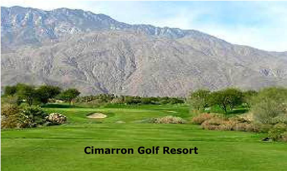
Cimarron Golf Resort