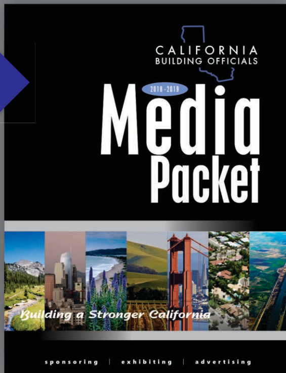
Exhibit & Sponsor

Take advantage of this one resource for all your CALBO marketing needs to reach CALBO membership throughout the year.