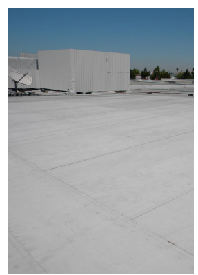
Coating for a low-sloped roof