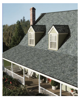
A residential cool roof

The Cool Roof Rating Council (CRRC), at www.coolroofs.org, is the sole entity the California Energy Commission recognizes for certifying the solar reflectance and thermal emittance values of roofing products. Only reflectance and emittance values listed within the CRRC's Rated Products Directory may be used to meet cool roof requirements. Products that meet CRRC certification requirements will feature the CRRC label.