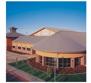
A non-residential cool roof